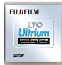
Fujifilm's Ultrium Universal Cleaning Cartridge is designed for use with all Ultrium 1, 2, 3, 4 & 5 tape drives.